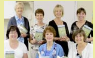
People of Purpose Book Study