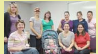
Moms Understanding Moms (MUMS)