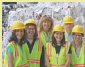
EarthCare Small Group