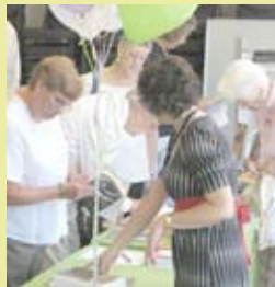
Disciple classes, Grief classes, Children's classes

Choose classes or a small group for stretching your faith