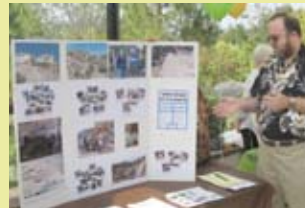
La Roca School and Church