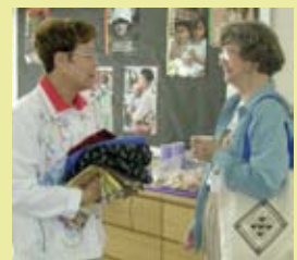
Prayer Quilt Ministry