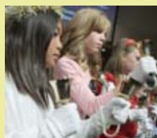
Ring the bells!