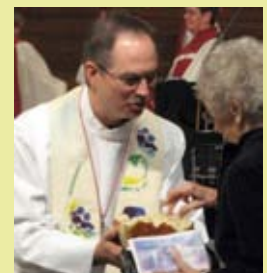
Participate in worship!

Now there are varieties of gifts, but the same Spirit; and there are varieties of activities, but it is the same God who activates all of them in everyone. To each is given the manifestation of the Spirit for the common good. -I Corinthians 12:4-7