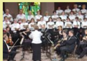
Raise your voice in song!